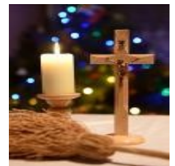
Rest in Peace